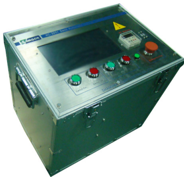
Control and Measuring System