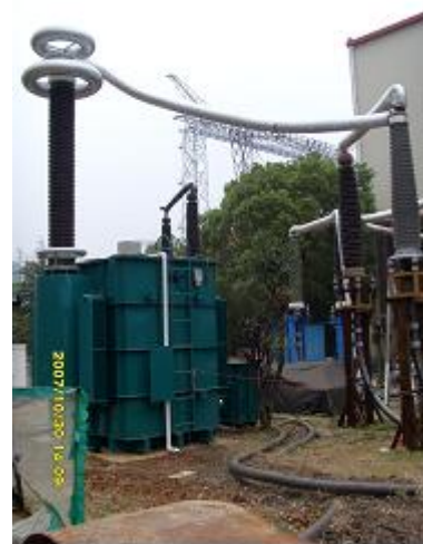
350KV/10A Tank type Tunable Reactor Resonant Test System