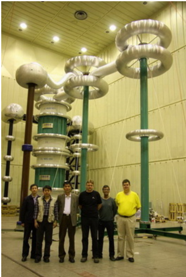
SGM3200KVA/800KV Helsinki University (Finland)