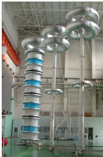
1200KV/3A Module Tunable Reactor Resonant Test System