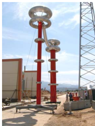
1000KV/5A Module Tunable Frequency Resonant Test System (Oil Type)